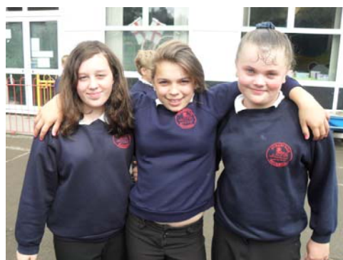
Our Year 6 pupils who transferred to secondary education July 2010

At the end of the summer term of the year in which they have their eleventh birthday they transfer to Secondary school, usually to Ludlow School, Wigmore High School or to Bishops Castle Community College. The school has excellent links with these schools, and every effort is made to make the transfer as easy as possible. Parents will be informed in advance of details and options relating to the transfer of secondary education.